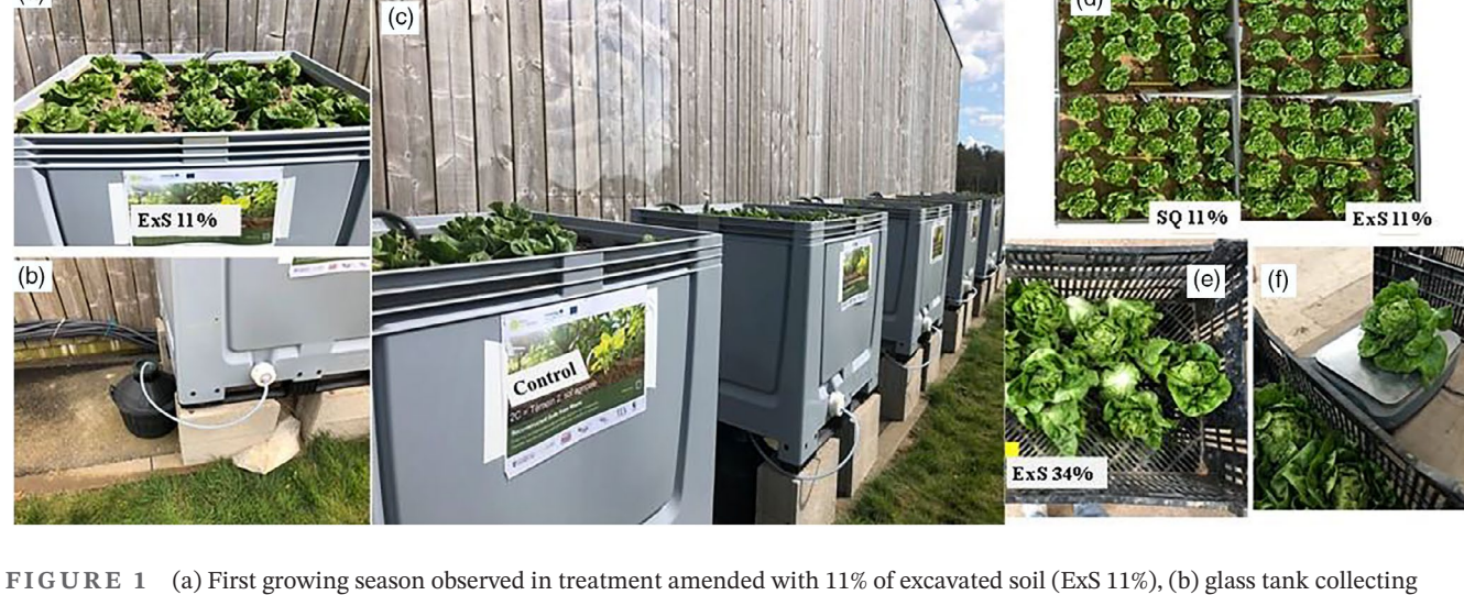
FIGURE 1 (a) First growing season observed in treatment amended with 11% of excavated soil (ExS 11%), (b) glass tank collecting drainage effluent, (c) experimental setup, (d) third growing season of lettuce a few days before harvest, (e) total yield, which is the sum of all fresh weights of lettuce harvested from each treatment at the end of the experiment and (f) fresh weight of individually harvested lettuce heads.

The assessment of the structural stability of soils is currently the object of an intense debate in the soil science community (Baveye et al., 2022; Vogel et al., 2022) and no