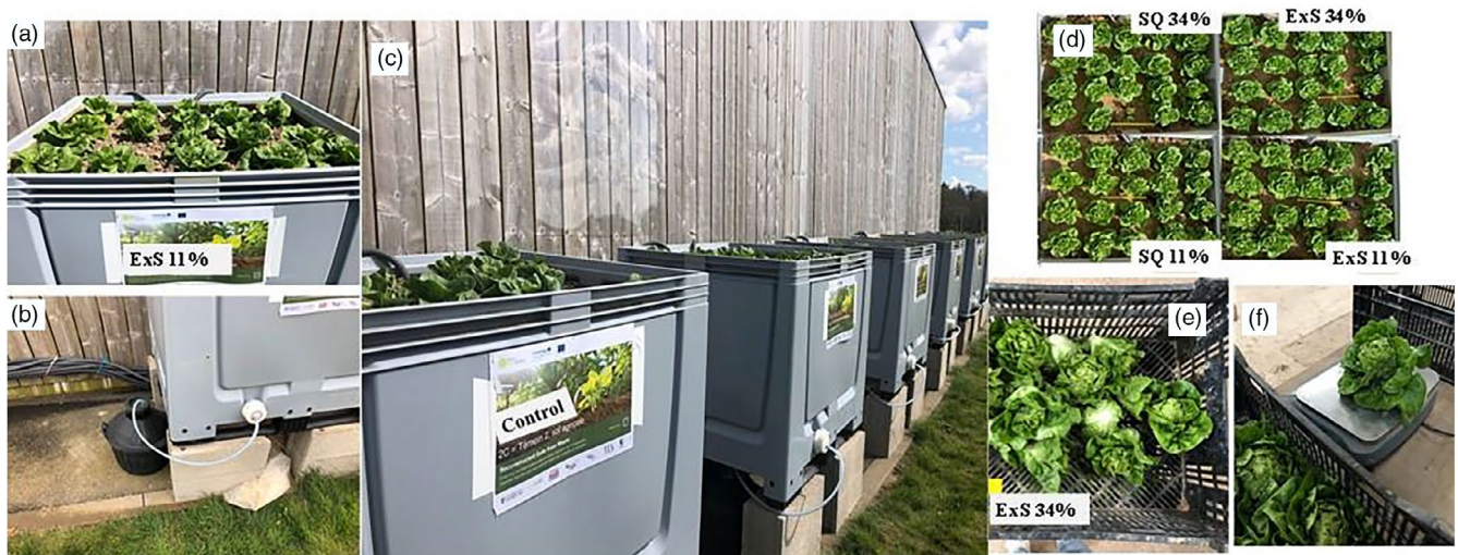
FIGURE 1 (a) First growing season observed in treatment amended with 11% of excavated soil (ExS 11%), (b) glass tank collecting drainage effluent, (c) experimental setup, (d) third growing season of lettuce a few days before harvest, (e) total yield, which is the sum of all fresh weights of lettuce harvested from each treatment at the end of the experiment and (f) fresh weight of individually harvested lettuce heads.

The assessment of the structural stability of soils is currently the object of an intense debate in the soil science community (Baveye et al., 2022; Vogel et al., 2022) and no