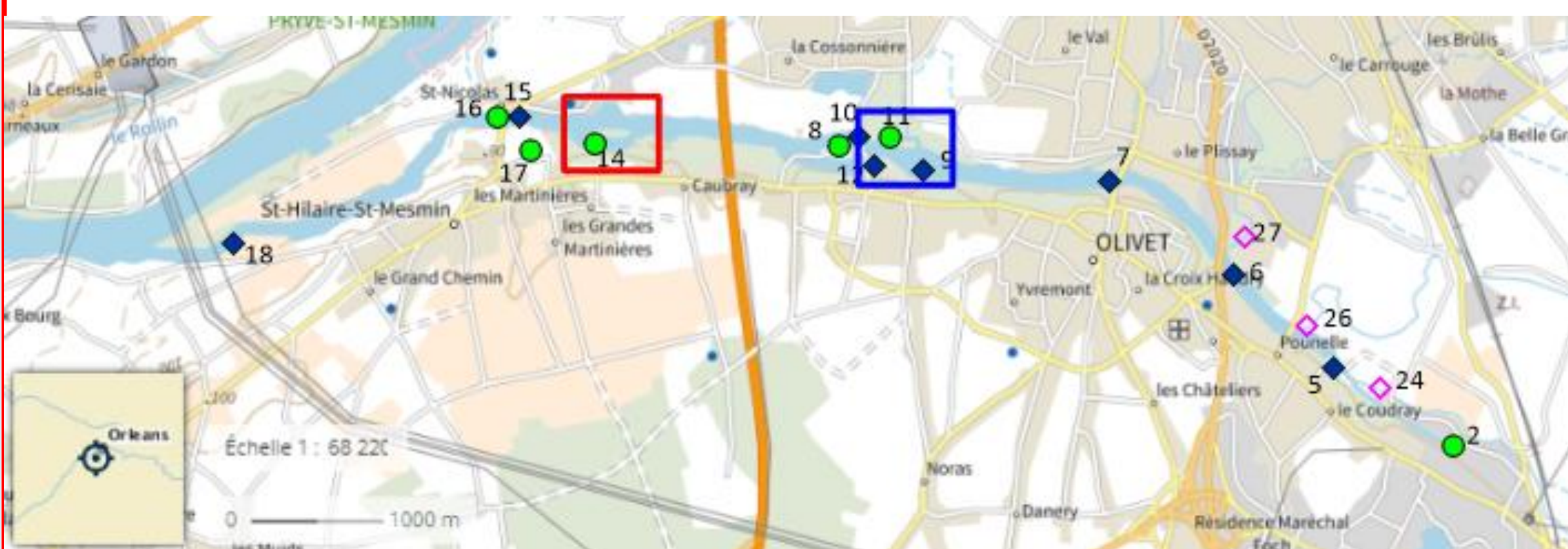
Fig.1 : Location of Loiret River and Springs sampling points

Two sampling campaigns were implemented for chemical and isotopes at similar hydrological conditions, in 2020 and 2021 including the Loire River, the Loiret River at 9 sites, the two main local and regional aquifers, five of the main springs linked to the Loiret River. At the same time in situ measurements (conductivity, T^\circ , pH, dissolved \text{O}_2 ) were taken from a boat along the 13kms of the Loiret River (Figure 1).