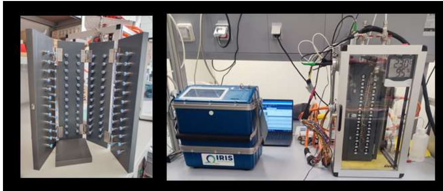
Figure 1 : On the left view of the open antenna counting 96 electrodes, on the right view of the acquisition central together with the closed antenna disposed within a confining unit

channel measurement and switching, provides us with a 3D investigation of our probe. Our samples collection gathers about thirty specimens, most of them armed, differing in the mix or in the rebar preparation. Some have been specifically designed to test the widely reckoned ability of this method for heterogeneous matrix characterization, on our unusually small sample dimension.