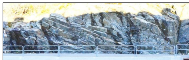
Figure 1. Mannsverk outcrop, 20m-wide, 3-m-high, North is to the left, the outcrop is facing West. The geological scan line was surveyed slightly above the hand rail, from this perspective.

FACETS was applied to a 3D point cloud of road section located in Mannsverk, a suburb east of the city Bergen, Norway (5.3683°E; 60.3571°N). The outcrop faces west with a crudely north-south trend. The rock is an “amphibolite, transformed and severely deformed gabbro and green stone with bands of trondhjemite” (NGU, 1/50.000 geological map). The outcrop is 20m long and 4m high.