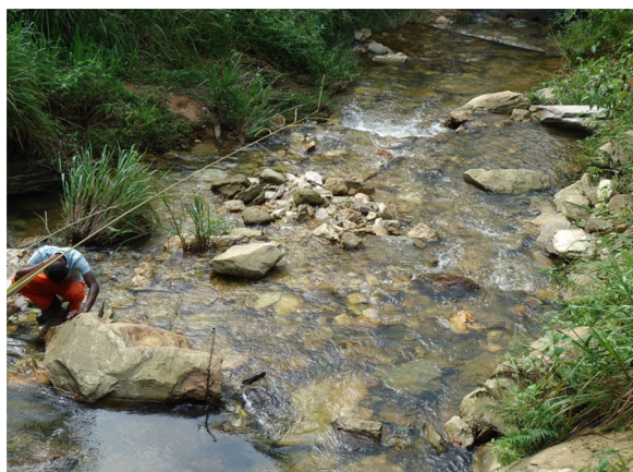
Fig. 3. A typical river in western Congo (Mayombe region) with bed covered by an accumulation of large and more or less rounded blocks of crystalline rocks of varied nature.

Moving from the top to the bottom of the watersheds, one can see an increasing proportion of rounded elements, sometimes one meter or more in diameter along the bed of some rivers. For us, this organization suggests a single sedimentological system, at least at the scale of the Gabonese territory, involving mass movements along the slopes and highly energetic (i.e. torrential) transport along the riverbeds (Fig. 3). Maley et al. argue that such a torrential dynamic is inconsistent with the low slopes of the rivers. Low slopes are indeed prevailing for the Gabonese rivers, so that it is actually an enigma how such torrential events could have occurred. Nevertheless, the organization we note above is clearly inconsistent with the SL as being the results of (multiple...) large landslides. Nevertheless, as mentioned earlier, we agree that the upper part of the system (i.e. hill slopes) evolved by debris flowing.