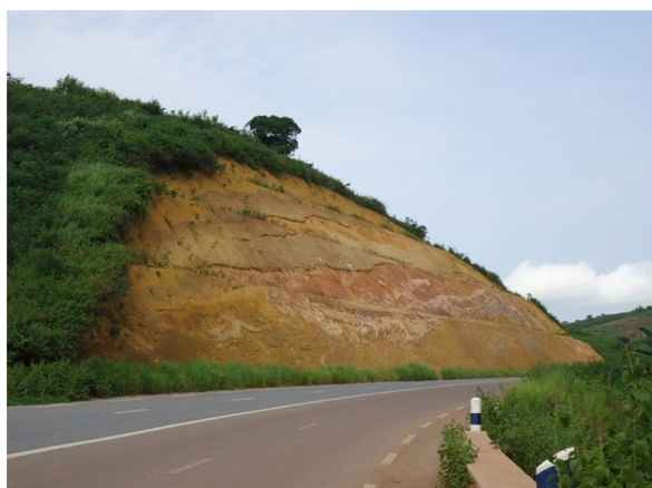
Fig. 4. A typical landscape of western Congo with the Cover Horizon forming a very homogeneous layer, about 2 meters thick, covering a steep hill.

By reference to another paper (Thiéblemont, 2013), Maley et al. agree that aeolian processes could have been a