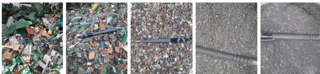
Figure 2. WPCBs samples (raw material, -30 mm, -10 mm, -2 mm and -750 μm, from left to right).

WPCBs used in this study were provided by a French recycling company, from the small waste electrical and electronic equipment category (mix of appliances such as computer, audio and video equipment, toys, personal care products, small kitchen appliances, etc.). The whole methodology used for sampling the 526 kg batch of WPCBs was previously detailed in in Hubau et al. (2019) 3 and is given in Figure 1. Photographs of samples are given in Figure 2.