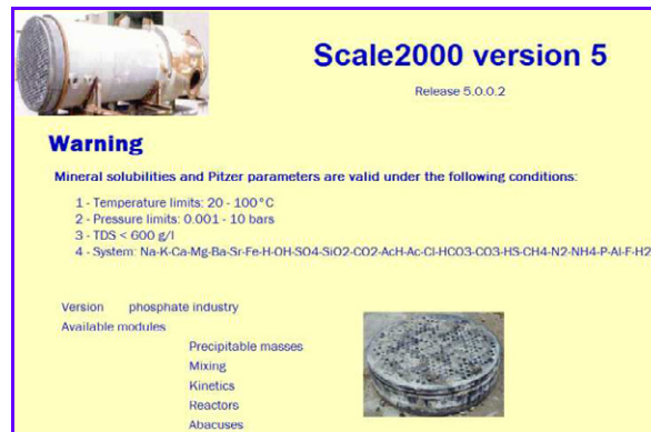
Figure 2 - Welcome page of the SCALE2000 software: limits of use and main available functionalities are listed.

Then, the menus of SCALE2000 offer the possibility to select different types of calculations: i) aqueous speciation of the dissolved species, saturation indices of minerals, partial pressure of gases ( \text{CO}_2 , \text{H}_2\text{S} , \text{SiF}_4 , etc.); ii) precipitable masses of one or more minerals previously identified as supersaturated with respect to the aqueous solution; iii) mixing of two aqueous solutions having contrasted physico-chemical properties; iv) kinetics of dissolution and precipitation of minerals according to an adapted kinetic law from the transition state theory (TST); v) series of reactors which allow accounting simultaneously for flow rate and mixing effects into part of a typical phosphoric acid production flow-sheet, determining the accumulation of deposits with time throughout the whole chain and; vi) abacuses representing various key parameters evolution (mineral solubility, gas pressure, water activity, etc.) as a function of \text{P}_2\text{O}_5 concentration, temperature, etc. [20].