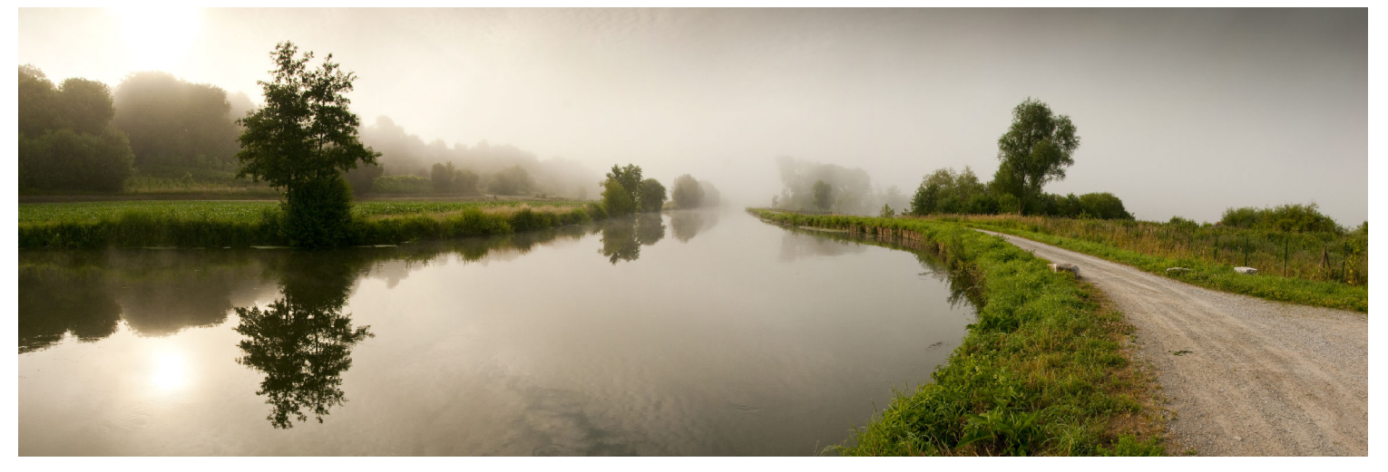
The banks of the Somme from the marshes of Longpré-les-Corps-Saints, Picardie