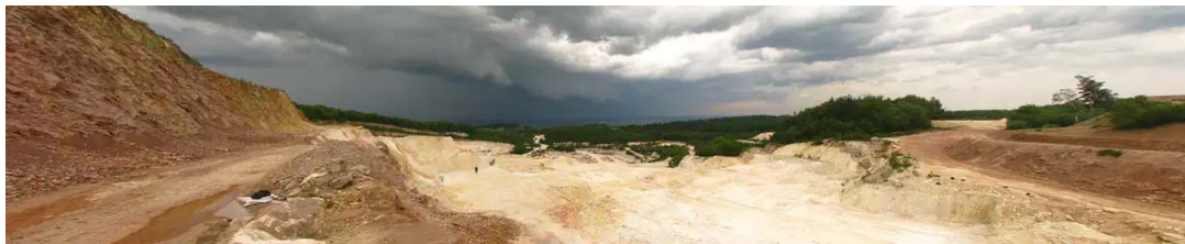
Beauvoir rare metals granite in the Allier department, currently being mined for kaolin (2012).

We will also need to be able to develop methods that can be used all over France, for extracting mineral resources that are adapted to our geology. Lithium resources are diverse, varied and heterogeneously distributed in our subsurface, not all the industrial processes for extracting lithium from the various geological reserves are currently operational. This is due either to technological reasons, or because they are not cost-effective.