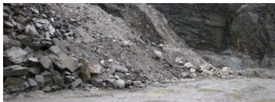
Spodumene-bearing pegmatite, at Mina Alberto, Spain (2010).

La version originale de cet article a été publiée en français.