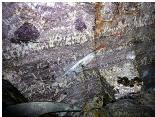
An example of lithium-rich rock called pegmatite, with a characteristic purple colour and which is composed of lithiniferous micas, feldspar and quartz. Chédeville (Haute-Vienne). The pick of a geologist's hammer indicates the scale.

Like most of its European neighbours, France currently imports large quantities of the metals needed for its industry. This offshoring of mining sectors allows us to conceal the conditions under which these substances are extracted. If conducted without the necessary standards and controls, this activity can cause environmental damage, including unregulated discharges of waste, and generally do not guarantee workers the necessary standard measures for their protection. It also pose problems in terms of sharing and having access to water in arid regions, for example in the salt flats of South America.