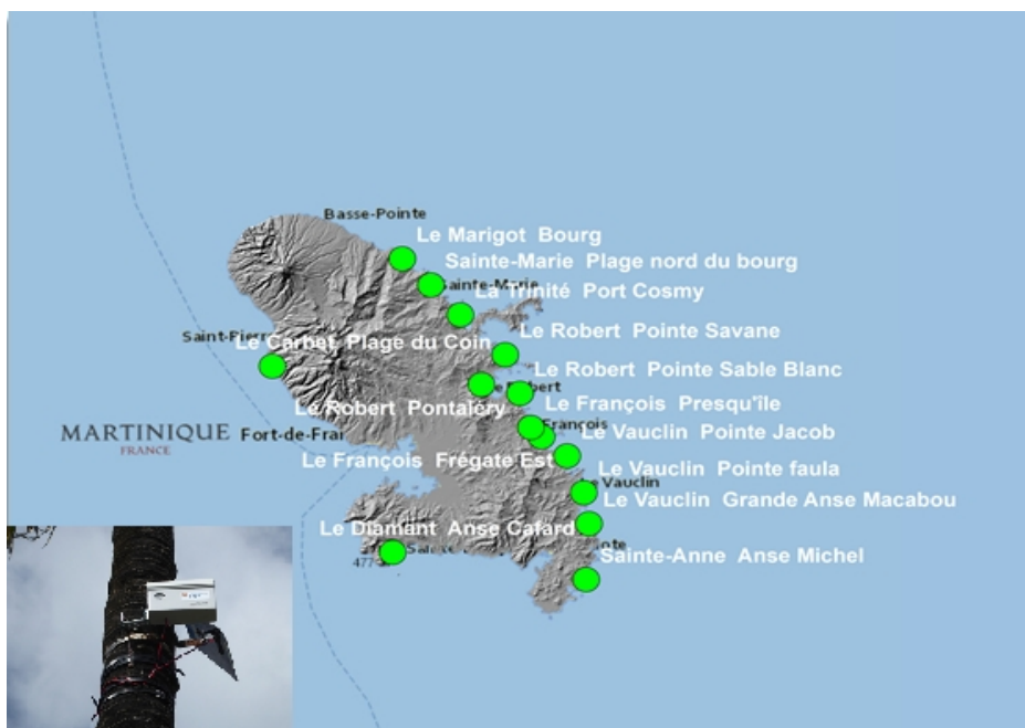
Figure 1. Distribution of installation sites in the Martinique island. Bottom-Left: Example of installation on a palm tree at Le Diamant, Anse Cafard.

A system composed of low-cost, smartphone-based cameras, ©SOLARCAM ( https://www.solarcam.fr ) has been installed in the Martinique's island aiming both coastal morphodynamics and beach/water quality monitoring. The latter focused on the investigation of the beached/floating algae in order to help providing instruments and data to local authorities for coastal management policy. At the time of writing, several sites among beach and harbors (n. 14) have been