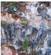
Figure 2: Detail of the outcrop at RN1 site, showing the roughness of the parent rock (basalt).

Figure 2 shows the roughness of the parent rock (basalt) at the RN1 site, translated by the expert by a variation of parameter S between 0 and 0.1 m. The variation of the maximum runout CDF compared to a simulation for which all the parameters vary simultaneously is estimated using the Kolmogorov smirnov statistic (denoted KS distance), which can vary between 0 and 1. The larger the KS distance, the larger the importance of the studied parameter on the simulation results (central insert of Figure 1). For all parameters, we study the variation of the maximum runout CDF using 5 different fixed values of the parameter and by calculating the corresponding KS distances. The distribution of the obtained KS distances is represented using boxplots in Figure 1 (lower part). For the RN1 site, we observe that parameters S and F0 of the parent rock play a dominant role on the simulation results when compared to other