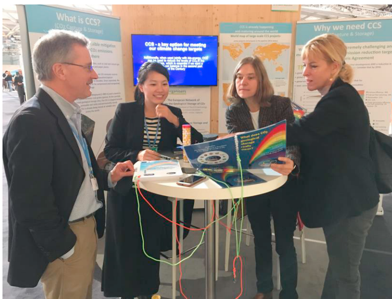
Fig. 2. Discussion at the CO 2 GeoNet/TCCSUA booth at COP23 in Bonn

Since 2013, CO 2 GeoNet has been an accredited observer organisation of UNFCCC, in the category “Research Institution NGO” (RINGO), and can therefore organise events at the Conference of the Parties (COP), both in the negotiation zone and in the public access zone. A major effort was made at COP21 in Paris in 2015, COP22 in Marrakech, and COP23 in Bonn in November 2017, in cooperation with other institutions. Participation at COP24 in Katowice (Poland) in December 2018 is currently being planned.