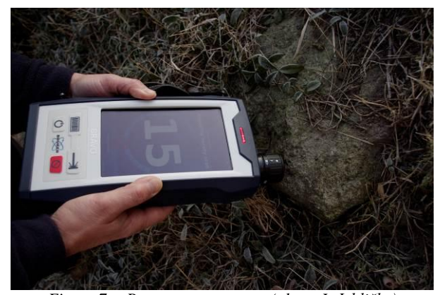
Figure 7: μRaman spectrometer

water contents in samples, but they may be affected by ambient light conditions and by cosmic ray interference. The interpretation of Raman spectra is not yet a routine process.