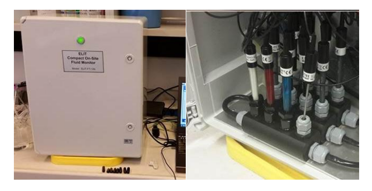
Figure 10: Fluid Management System consisting of a peristaltic pump and 12 ion selective electrodes

CSIRO within Deep Exploration Technologies CRC developed a fluid management system that has a peristaltic pump and 12 ISEs measuring pH, Eh and concentrations of a number of cations and anions (Figure ). This system pumps the fluid and continuously measures 12 parameters. The system can fit into a medium size Pelican case, and hence is transportable