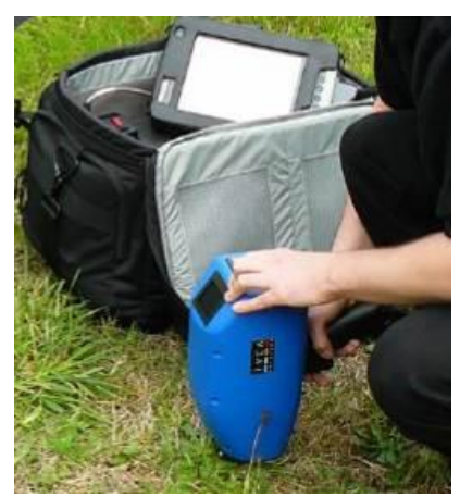
Figure 4: LIBS spectrometer

In principle, LIBS is a form of atomic emission spectroscopy, relying on characteristic spectra emitted from plasma generated by a high-energy laser pulse striking a sample (solid, liquid or gas). Each pulse produces a high-intensity plasma that is detected by a series of spectrometers, and the resulting emission spectrum contains atomic emission lines from the atomic species present in the plasma. The spectrometers are able to measure, with varying degrees of sensitivity, almost every element in the periodic table within each laser pulse. Quantitation is achievable either by conventional calibration methods using defined standards, or by chemometrics methods.