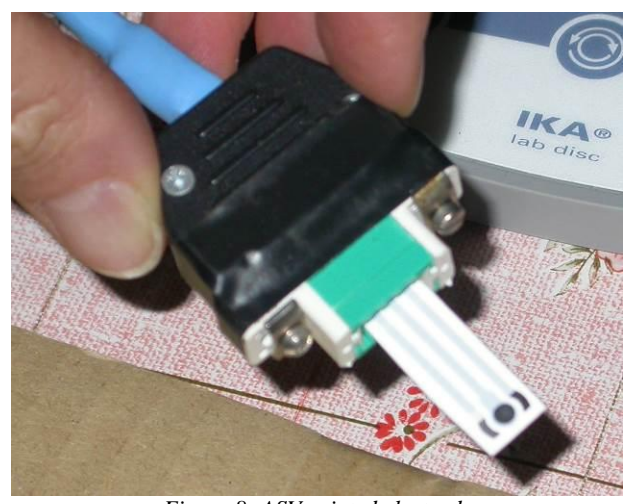
Figure 8: ASV printed electrode

Field applications of voltammetry and polarography are based on miniaturised laboratory instruments. They were developed decades ago as this technology was known for a long time, but did not reach widespread use due to troublesome electrode operation. Anodic stripping voltammetry (ASV) uses a novel electrode printing technology (Pérez-Ràfols et al., 2017) to become field portable (Figure ). It allows on-site trace level analysis in water for commodity (Cu, Zn, Pb, and also Ni, Co, Au, Sn) and environmental/trace elements (As, Cd, Hg, Mn, Se), down to 1 ppb in favourable conditions.