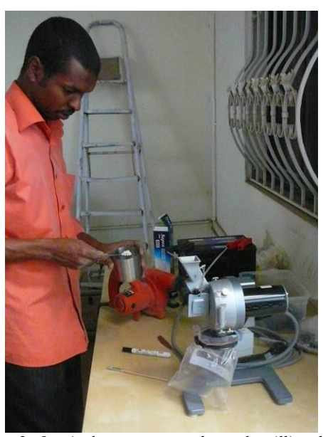
Figure 3: On-site battery operated sample milling device

Matrix-specific spectral analysis and dedicated calibration are not offered as standard by instrument providers, because they are not compatible with pXRF use on varied material. They can be developed on a narrower matrix compositional range with better accuracy and lower analytical limits. This will improve pXRF performance within a specified host formation (Steiner et al., 2017). Specific calibration schemes can also be designed to cope with interferences by an abundant element (for instance Fe, Cr) affecting the detection and accuracy of other elements within the same spectral region (Ni, Co, V).