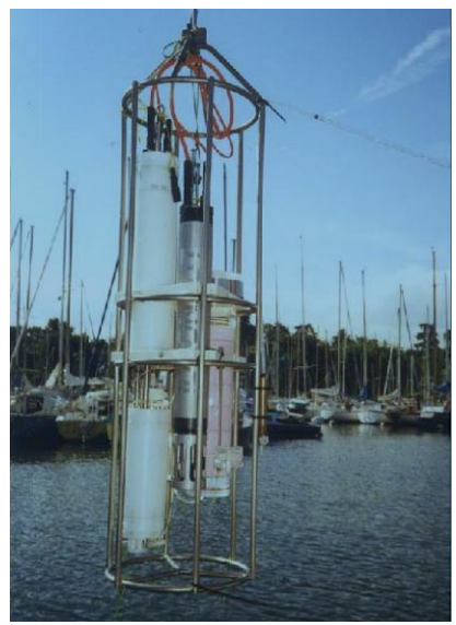
Figure 9: Voltammetric VIP probe

Unfortunately, the current miniaturisation efforts on this technology do not yet allow its implementation on standard 2" or 4" multiparametric probes. Such an advance would open doors for metal monitoring and groundwater hydrogeochemical exploration.