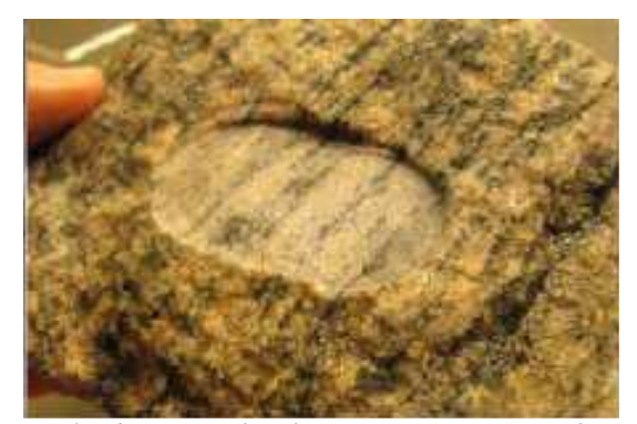
Figure 2: Abrasion surface for pXRF measurements

Surface irregularity, mineral heterogeneity and matrix effects were soon identified as major sources of error in quantitative pXRF analysis (Ge et al., 2005). The first one applies to measurements carried out directly on the rock face or core surface. It was addressed by Esbensen et al. (2015) by a field abrasion device (Figure 2Erreur! Source du renvoi introuvable.). This does not solve the mineral heterogeneity issue but improves measurements dealing with it.