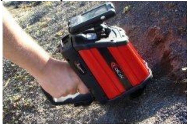
Figure 4: pFTIR spectrometer

There is a need for a chemometrics approach to process the data and for the development of exploration-oriented standard libraries. pFTIR spectrometers have a proven potential for hydrothermal alteration recognition and mapping (Chang & Yang, 2012; Zadeh et al., 2014; Huang et al., 2017), identified before field technology was easily accessible (Thompson et al., 1999). They can therefore complement elemental analyses (pXRF, LIBS) for target identification and delineation.