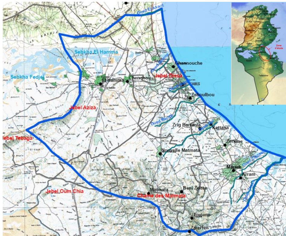
Figure 1- Map of the study area showing the boundaries of the aquifer and locations of the oases

The socio-economic development of the Jeffara of Gabes, located in the southeast of Tunisia, has led to a strong exploitation of the coastal aquifers groundwater which has induced a drying up of the springs that supplied the oases (figure 1). The objective of the study is to improve the management of groundwater resources in the Gabes area, taking into account the needs of socio-economic activities and the sustainable preservation of coastal oasis ecosystems.