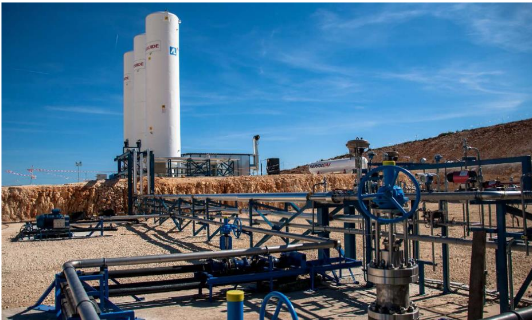
Figure 2: The Hontomin Pilot site: injection infrastructure and CO 2 tanks