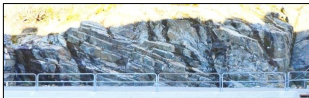
Figure 1. Mannsverk outcrop, 20m-wide, 3-m-high, North is to the left, the outcrop is facing West. The geological scan line was surveyed slightly above the hand rail, from this perspective.

FACETS was applied to a 3D point cloud of road section located in Mannsverk, a suburb east of the city Bergen, Norway (5.3683°E; 60.3571°N). The outcrop faces west with a crudely north-south trend. The rock is an “amphibolite, transformed and severely deformed gabbro and green stone with bands of trondhjemite” (NGU, 1/50.000 geological map). The outcrop is 20m long and 4m high.