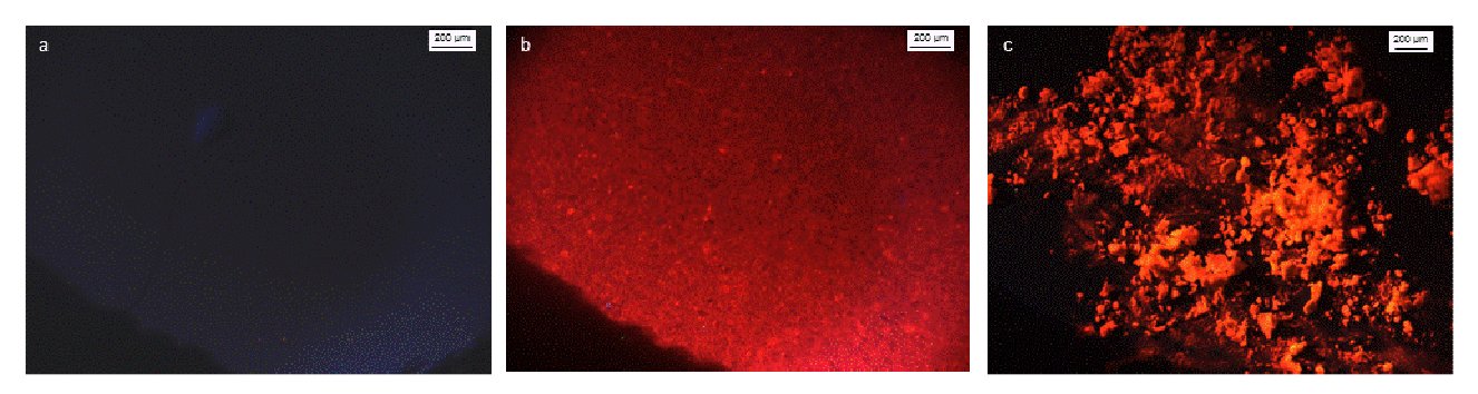
Fig. 2. CL photomicrographs of studied minerals; a: dark blue pristine synthetic calcite pellet (gain 6, laying time 1s, x40), b: red natural dolomite pellet (gain 6, laying time 1s, x40), c: final yellow-orange powder of mixed calcite-dolomite system (gain 6, laying time 1s, x50).

ICP measurements in pristine dolomite, it could have been present in very low amount, thus explaining the luminescent signal in calcite [12].