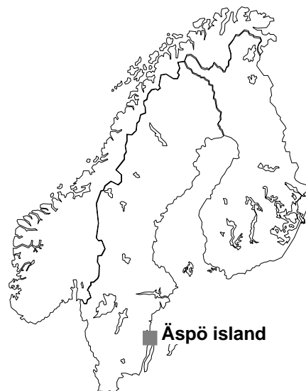
Figure 1. Situation of the study site

In the following, we describe, as an example for the application of the SCS approach, the attempt to reconstitute the geochemical and flow conditions at Äspö from the last deglaciation to the modern natural conditions prevailing before the construction of the underground laboratory.