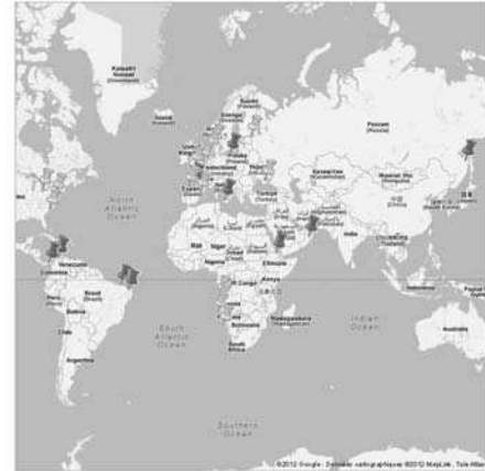
Figure 1: Map of a part of potential HAWI locations.

/ infirm that the observed shoreline sandwaves could result from HAWI mechanism.