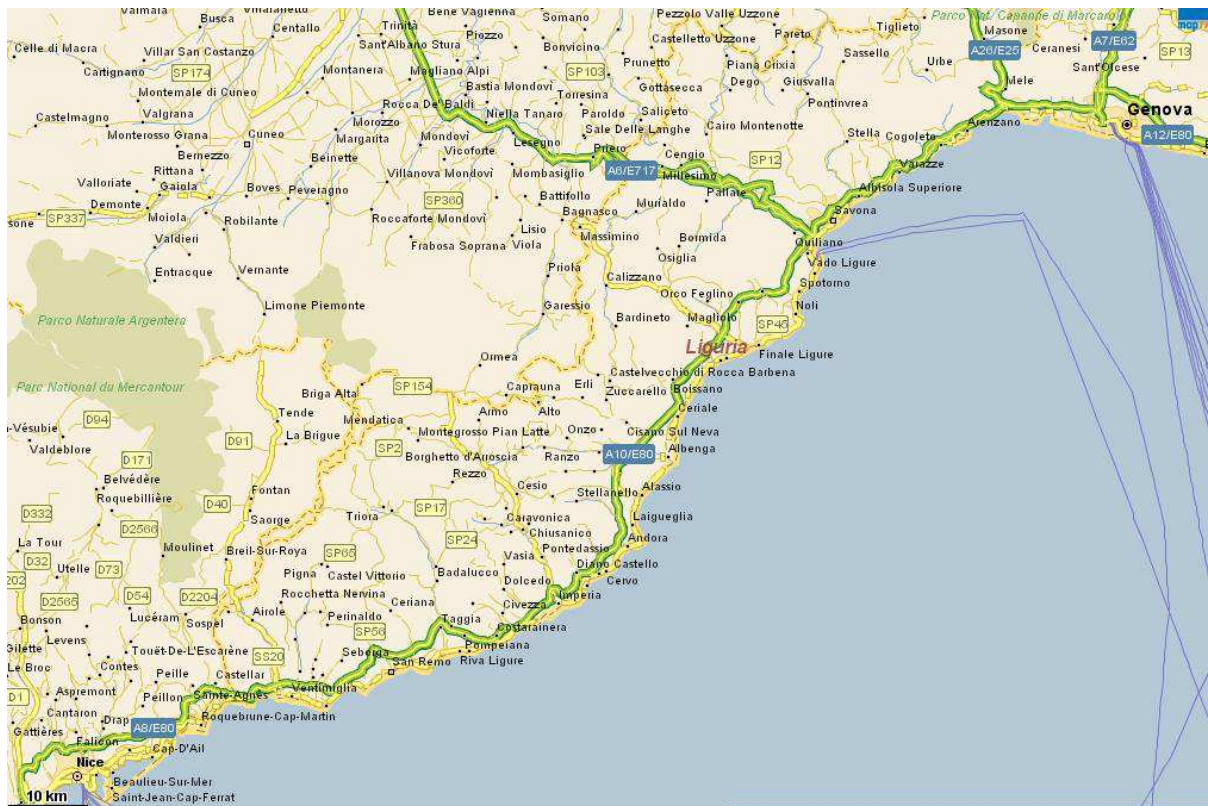
Figure 1: Location of the zone considered in the pilot project.

In this pilot it is planned to particularly focus on the following three different situations that feature different types of instrument and data: the motorway (E80) from Nice to Genoa, roads in the valley of Roya and departmental roads (in order to integrate the departmental authorities in the project). This choice of three different levels of roads should allow potential problems with wider-scale implementation of the developed system to be highlighted.