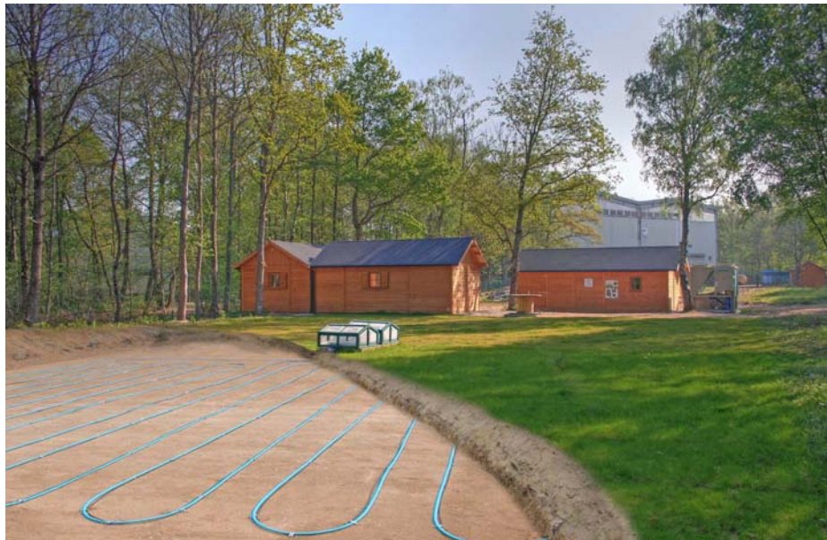
Figure 10: The experimental platform - Sight of the wooden technical buildings