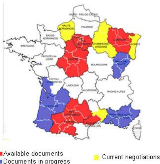
Figure 7: The program to develop GIS for regional geothermal groundwater resources (Available on : www.geothermie-perspectives.fr )