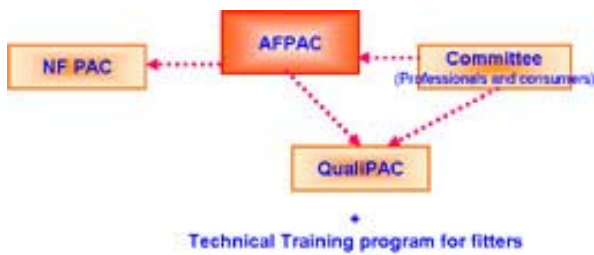
Figure 3: Quality device of the AFPAC