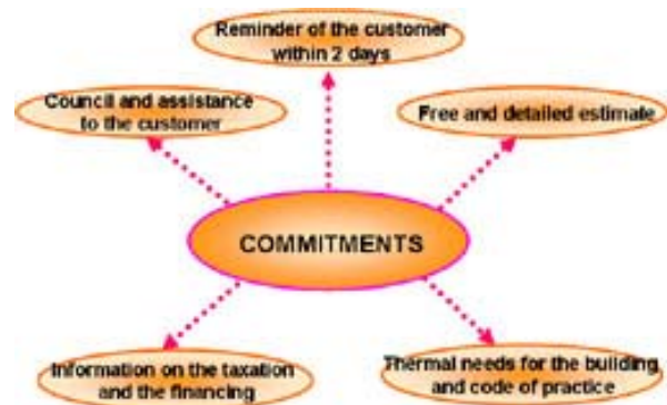
Figure 4: 5 of the 10 commitments of the QualiPAC fitters