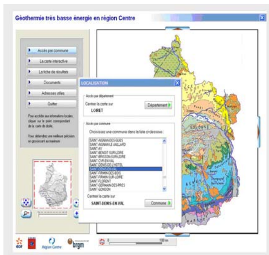
Figure 6: Example of GIS for regional geothermal groundwater resources, available on CD-Rom or Web site

They are mainly dedicated to medium to large scale ground water heat pumps , for buildings of the service sector (office blocks, hospitals, Shopping centres, hotels, etc.)