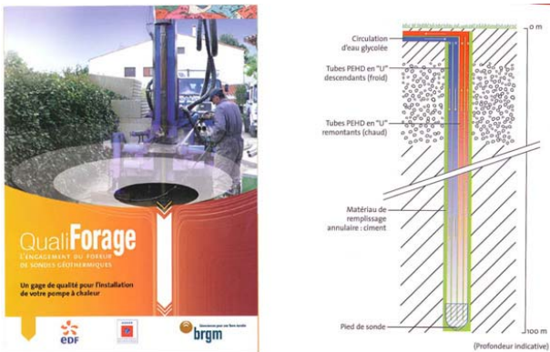
Figure 5: QualiForage technical documents

In return they benefit from the communication campaigns of ADEME, BRGM and EDF and they are clearly identified by the public as drillers engaged in quality. The list of the drillers involved in the charter can be consulted on the common website of ADEME and BRGM on geothermy ( www.geothermie-perspectives.fr/ ) and on AFPAC website ( www.afpac.org )